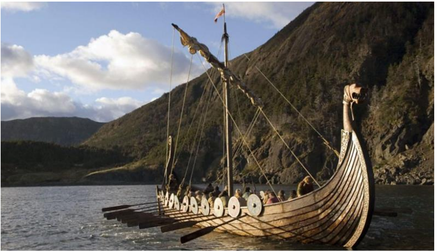
A Viking longboat.

I hope you all have a lovely weekend and stay safe!