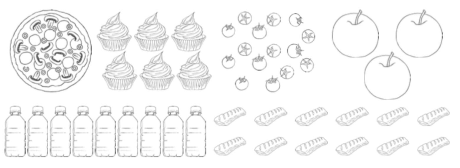
Aneesa, Imran and Eddie are having a picnic. Share the food out equally between them so that they have \frac{1}{3} each.

Send me your answers. Make sure to use your sharing circles and show your working to earn <u>dojos</u>! There is a super challenge for <u>extra dojos</u> below too. Why don't you stretch yourself today?