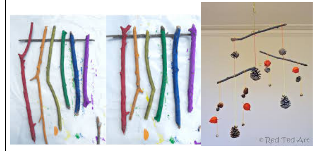
Please send us pictures of your creations, we would love to see them!