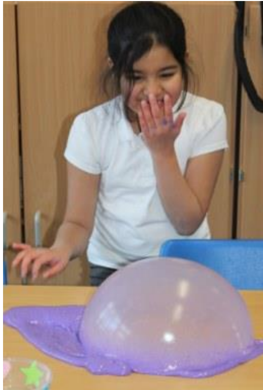
11 - Blowers Green Primary pupil enjoying 'Slime' during Wellbeing Wednesday.