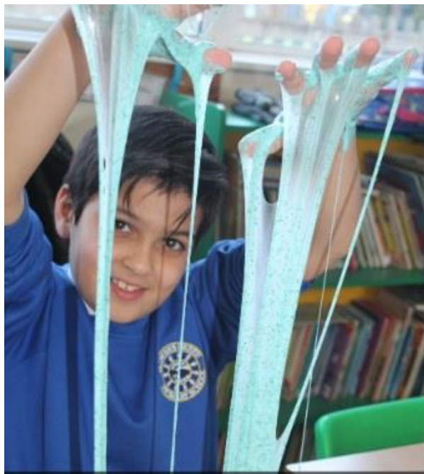
10 - Blowers Green Primary pupil enjoying 'Slime' during Wellbeing Wednesday.

A range of information and resources including access to external support can be found on each academy website under Curriculum > Mental Health, Wellbeing & Online Safety.