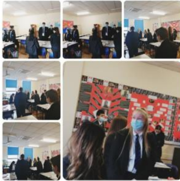
9 - Learners at St James Academy stand in silence.