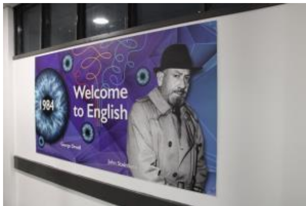
8 - The redecorated English Department at Pegasus Academy, where there are new white boards and ICT resources, including 75" interactive digital screens.