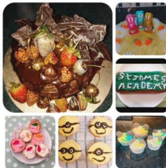
5 - Well done to all St James learners involved in the Bake Off...

Normally, we wouldn't put a picture of a giant chocolate cake into our newsletter, but we thought you might like to see what happened when Year 11 and Year 7 at St James Academy held a Bake Off competition!