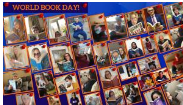
23 - Learners and staff and St James Academy on World Book Day.

are now reading more challenging texts and this will undoubtedly benefit them when studying all parts of the curriculum.